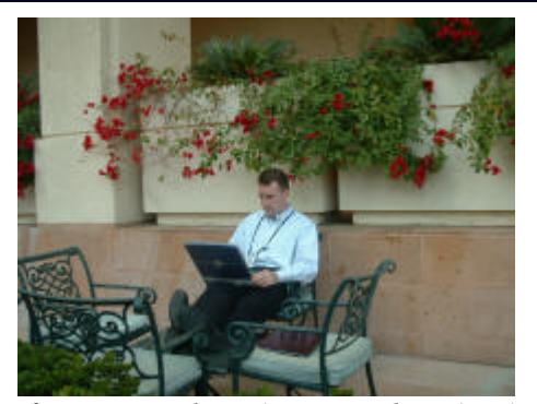
A conference attendee enjoys some downtime in the sunshine

ATP's fifth annual conference combines relaxation with high quality learning programs and network opportunities